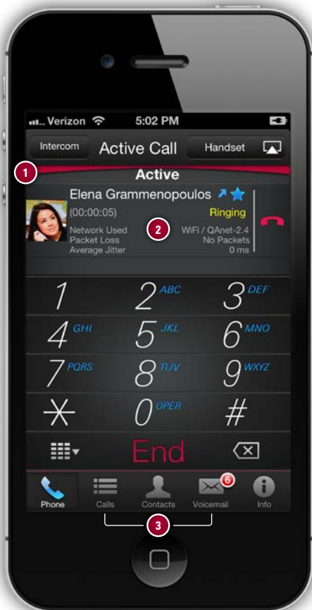
Allworx Reach iPhone App