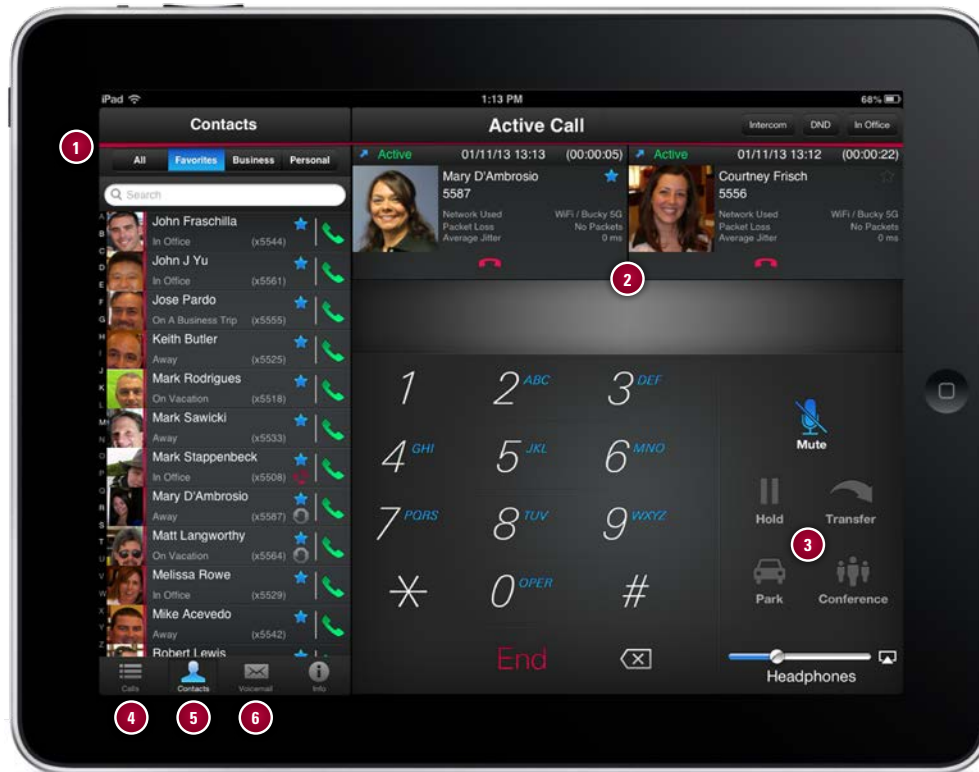
Allworx Reach iPad App